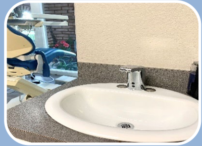
Touch-free Faucets & Soap Dispensers