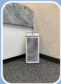
HEPA & UV Air Filtration Systems