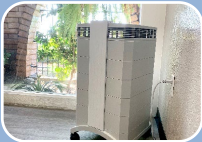
Aerosol Droplet Reducing Systems